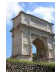
Arco di Tito

Religious Pluralism, the “Resurgence of God” and politics: Rome historically has been at the center of the debate over pluralism that has become a hallmark of contemporary religious life. Accordingly, Rome provides an intriguing setting in which to